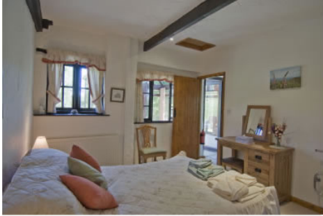
The bigger bedroom