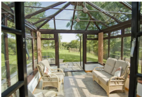
The light and airy conservatory

Now has a new conservatory. It has made such a difference to the size of this cottage as it has given an extra living space and this refurbishment gave us the opportunity to make the bedroom bigger. In November, both the shower and kitchen had a major refit so by Christmas it will look quite stunning.